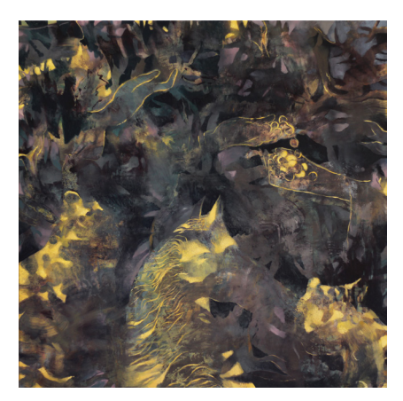
Ombre dorate, 2022 Luca Ceccherini Oil on canvas | 140 x 140 cm 4.200 €