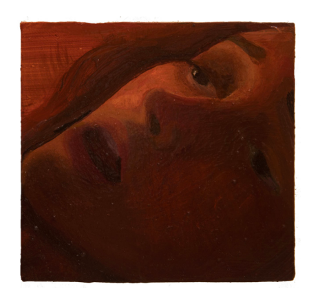
Bliss, 2022 Beatrice Alici Oil on panel | 12,3 x 12,6 cm 600 €