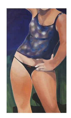
Una sera a caso, 2022 Adelisa Selimbašić Oil on canvas | 151 x 71 cm 4.100 €