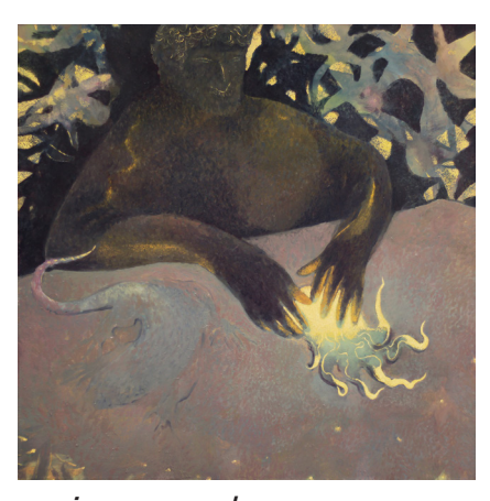
Giovanni accende un guoco, 2023 Luca Ceccherini Oil on canvas | 100 x 100 cm 3.000 €