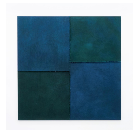
Verde e blu nel blu blu, 2021 Hermann Bergamelli

Cotton stitched and dyed with elements of natural and chemical origin | 200 x 200 cm 6.800 €