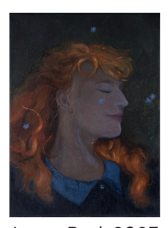
Lawn Bed, 2023 Beatrice Alici Oil on canvas | 40 x 30 cm 1.800 €