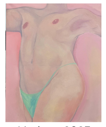
Medusa, 2023 Adelisa Selimbašić Oil on canvas | 100 x 80 cm 3.100 €